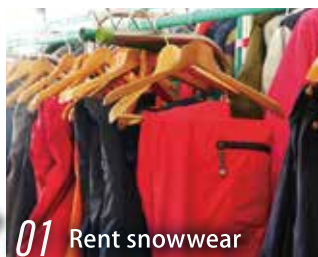
01 Rent snowwear