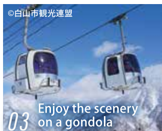
03 Enjoy the scenery on a gondola